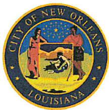
LaToya Cantrell MAYOR

715 South Broad Street New Orleans, LA 70119